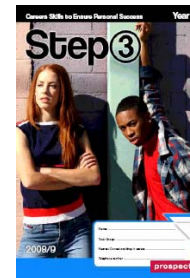
Step 3 (11)