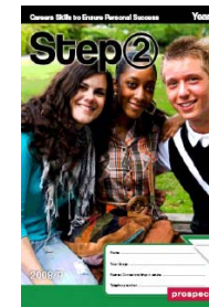
Step 2 (10)