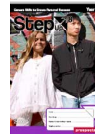
Step Up (8)