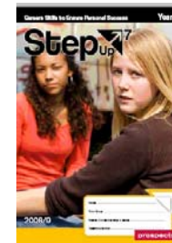
Step Up (7)

Brent Connexions will be trialling a new online version of the booklets in 2008/9, about which all schools and alternative providers will be contacted.