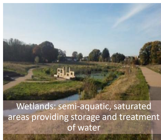
Figure 6.1: Examples of different types of Sustainable Drainage Systems

More information on different types of SuDS and their benefits can be found on the SusDrain website. Given the urbanised nature of Brent, it is important to promote the use of SuDS which manage rainwater as close to the source as possible and simulate nature which is environmentally beneficial. They can most commonly be implemented in new developments but can also be retrofitted to existing