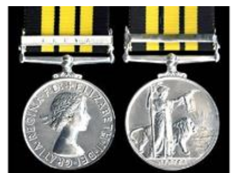
Africa General Service Medal

The Africa General Service Medal was awarded to soldiers involved in local wars or rebellions between 1900 and 1956. Most medals were granted to British led local forces, including the King's African Rifles and the West African Frontier Force.