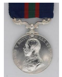
Distinguished Conduct Medal

Until 1993, the Military Medal was a military decoration awarded to personnel of the British Army and other services, and formerly also to personnel of other Commonwealth countries, below commissioned rank, for bravery in battle on land.