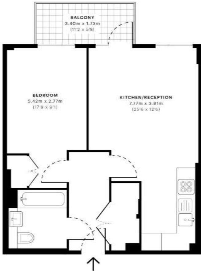
Sample one bedroom flat